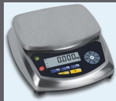
Stainless Steel FA-6000S