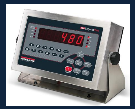
480 LED Display