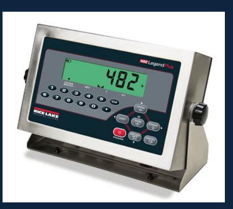
482 LED Display