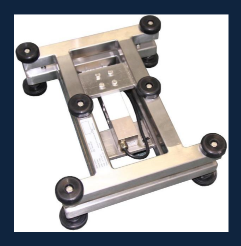
The bases used with the 480/482 system are fully Stainless Steel which includes the load cell.

Associated Scale Services Pty Ltd Ph:+61 (0)7 3272 0077 Email: info@associatedscales.com.au Web: www.associatedscales.com.au