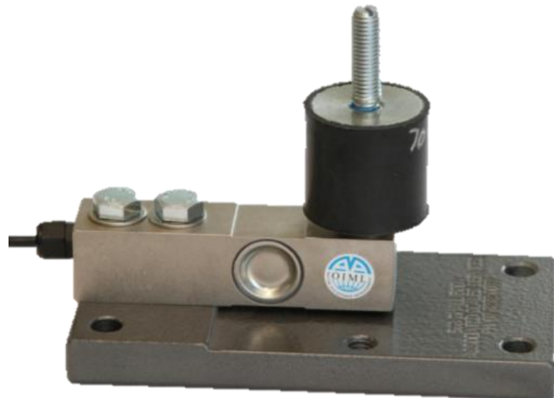
Picture of ASRM Weigh Module with 1t 563YH load cell Weighing Module designed and Manufactured in Australia by Associated Scale Service

Designed with the ANYLOAD 563YH Shear Beam Load Cell, the ASRM allows for a low-cost solution to weigh systems where vibration may be concerns.