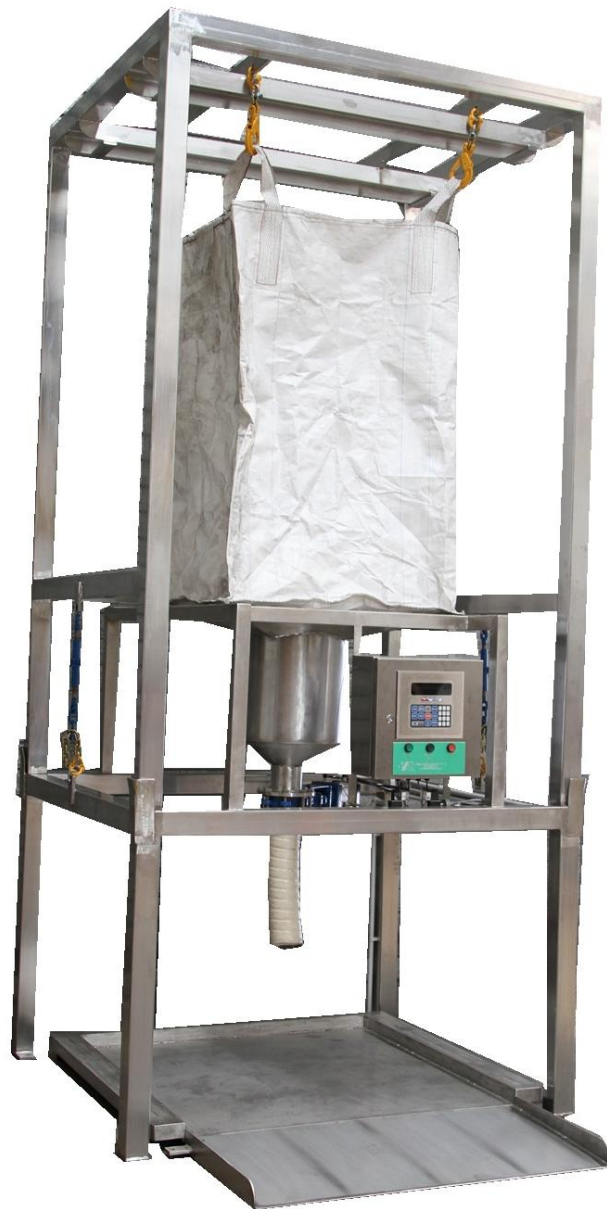
Picture of ASBB04 Bulka Bag Dispensing Unit

The ASBB04 is designed to simply and quickly attach a bulka bag and batch out into a smaller container. The high accuracy is achieved by pulsing the valve once the system will allow for reduced handling and a subsequent reduction of manual handling injuries.