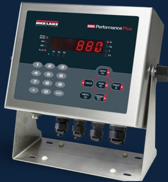
920i / 880 Controller from Rice Lake