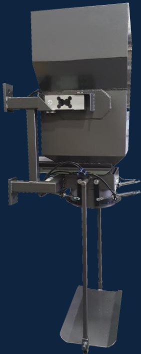
Single Product System