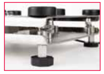
No Threads Visible Assures conformance to Food Safety standards and minimized contamination areas.