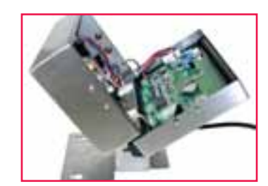
Internal Hinge Mechanism Easy access for option installation and servicing