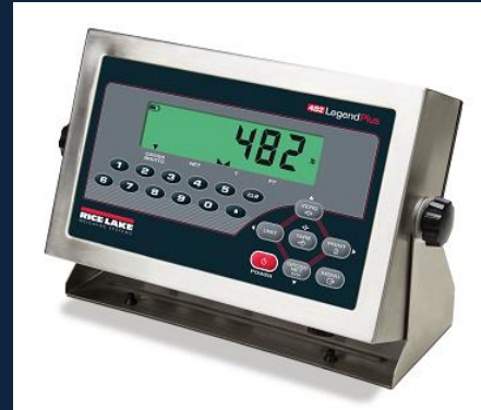
482 LED Display