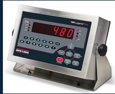
480 LED Display