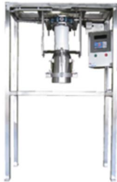
Picture of ASOB Bagging System

The ASOB bagging system is designed primarily for filling valve type bags. The system is gravity controlled utilizing a fully programmable industrial weight controller to ensure not only a quick bag fill but with high accuracy.