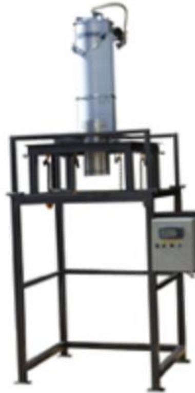
Picture of ASBB BULKA BAG BATCHING SYSTEM

The ASBB bagging system is designed primarily for filling Bulka Bags. The system is self-contained over-head weighing system with quick release safety hooks to attach the bag to. The safety hooks are adjustable for different bag heights.