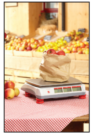
Fruit & vegetable markets

Aviator 5000 is a stylish, portable retail scale suited to a range of retail environments such as open markets, mobile business or smaller specialty shops. Its robust yet lightweight construction, including a high quality stainless steel plate, make it perfect for these kinds of environment where food hygiene, portability and sturdiness are prerequisits. Coupled with its high quality weighing technology this makes the Aviator a reliable and long lasting investment. Using the scale is also fast and effortless thanks to its ergonomic keyboard layout and simple user interface - thus speeding up customer service in all applications.