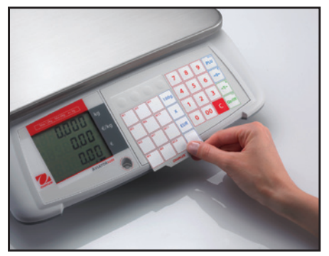
Exchangeable preset card