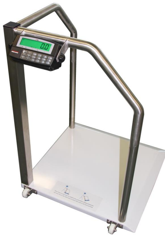
Picture of FB400 Bariatric Scale